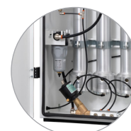
Nitrogen analyser (battery powered)