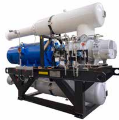
Process gas recovery