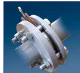
Non return valve

Blower stage: with gastight sealing of the driving shaft. It is available, optionally, the blower with a special anticorrosion coating protecting all the blower's components in contact with the gas. The blower is explosion and burst proof tested.