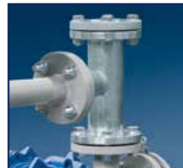
Bypass safety relief valve