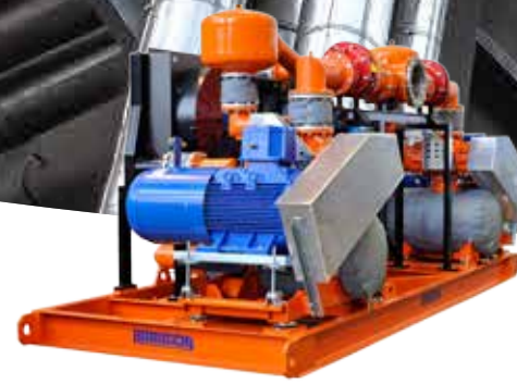
Recovery of methane from mines