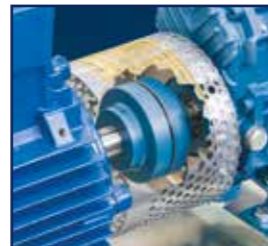
Coupling guards in ATEX version