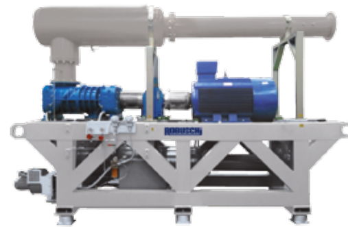
Nitrogen pneumatic conveying